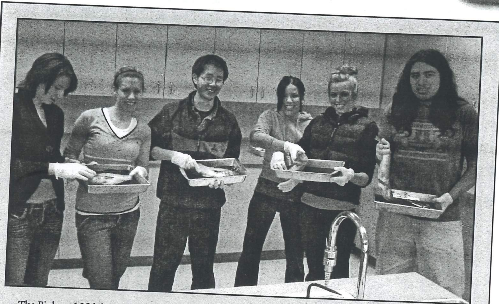
The Biology 102 lab class dissecting fish in order to learn about the internal structure of vertebrates.