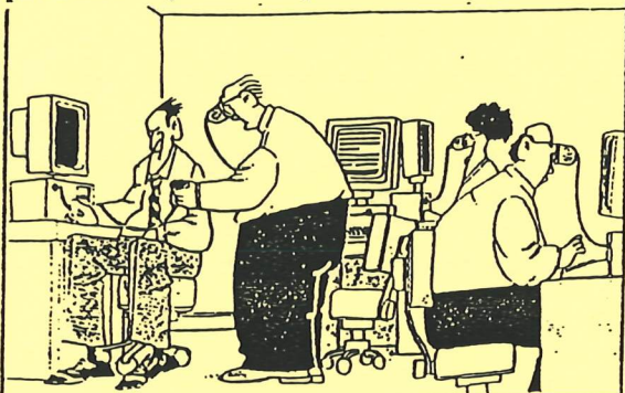
"CAME, BELMORAN, YOU KNOW AS WELL AS I DO THAT 'MOUSE-SCRAMBLING' IS OUR BEST DEFENSE AGAINST UNAUTHORIZED ACCESS TO PERSONAL FILES."

WITH HIS MOON IN LEO AND SCORPIO ASCENDING, BENNY SHOULD HAVE KNOWN BETTER THAN TO DIAGRAM THE NETWORK CABLING THAT DAY.