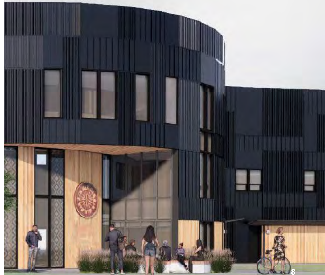
Photo is an illustrative rendering and is subject to change.

Besides 108 new beds for students, the student housing project includes new suites for Elders, student lounges, dedicated study space, Indigenous cultural spaces, and cooking facilities. Expected to complete in Fall 2021.